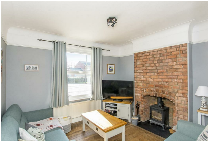
Lounge 10'9" x 12'0" (3.28m x 3.66m )

With a window to the front aspect this cosy lounge has the original brick fireplace which houses a newly installed wood burning stove set onto a slate hearth, sanded floorboards, original picture rails and coving to the ceiling.