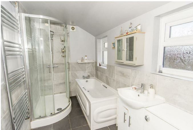
Bathroom 10'6" x 5'7" (3.20m x 1.70m )

This extended bathroom has a modern white suite comprising of a low flush WC, hand wash basin set into a vanity unit, bath, separate corner shower enclosure which is fully tiled. There is a chrome heated towel rail, extractor fan, ceramic tiled flooring and two obscure glazed windows.