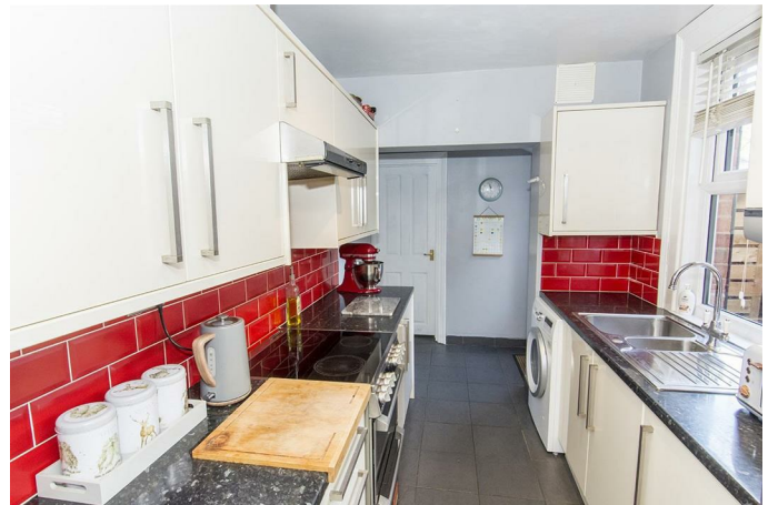
Kitchen ( Photo Two )

Fitted with a range of cream gloss cabinets with contrasting work surfaces and ceramic tiled flooring, a stainless steel bowl and half sink unit, cooker with extractor hood over, space for a washing machine and fridge freezer. A back door gives access to the outside and a window lets natural light flood in. The new Worcester Bosch gas central heating is mounted on the wall.