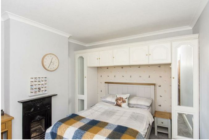
Bedroom One 10'4" x 12'1" (3.15m x 3.68m )

A double bedroom with a feature cast iron fireplace, a range of built in wardrobes and a window to the rear aspect.