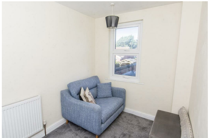
Bedroom Three 13'4" x 11'5" (4.06m x 3.48m )

A single bedroom with a window to the rear aspect which is currently being used as a snug.